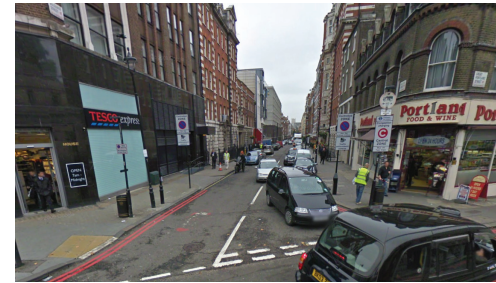
Bolsover Street as seen from Great Portland Street Station