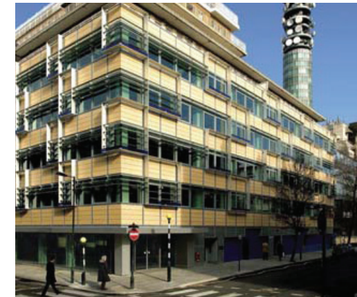
101 New Cavendish Street